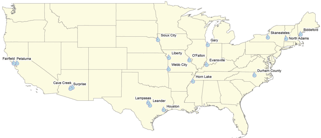
From 2007 to 2010, at least 18 local governments returned water and sewer systems to public hands to reduce costs.